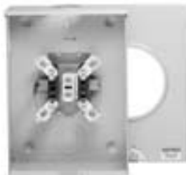
200 Ampere Single-Position Meter Socket