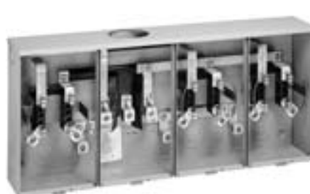
200 Ampere Multi-Position Meter Socket