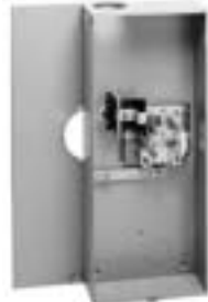
320 Ampere Lever Bypass Meter Socket