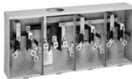
200 Ampere Multi-Position Meter Socket