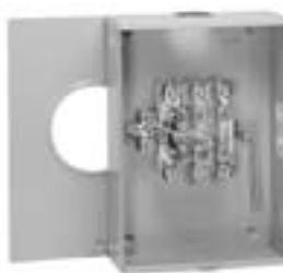
200 Ampere Lever Bypass Meter Socket