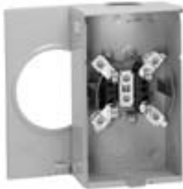
150 Ampere Single-Position Meter Socket