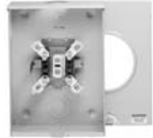
200 Ampere Single-Position Meter Socket