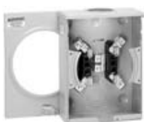
100 Ampere Single-Position Meter Socket